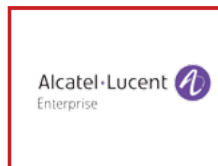
ALCATEL [ Reseller ] Business Telephony & UC