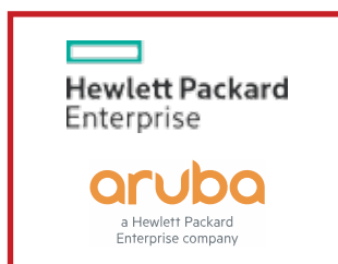
HPARUBA [ GOLD Partner ] Data Network

AMT understands the challenges faced by IT managers with limited resources , tight budgets , and new expanding demands from end users. For this reason AMT partners with market leaders in their fields that can deliver on their commitment to provide a high quality product on time to site and working properly.